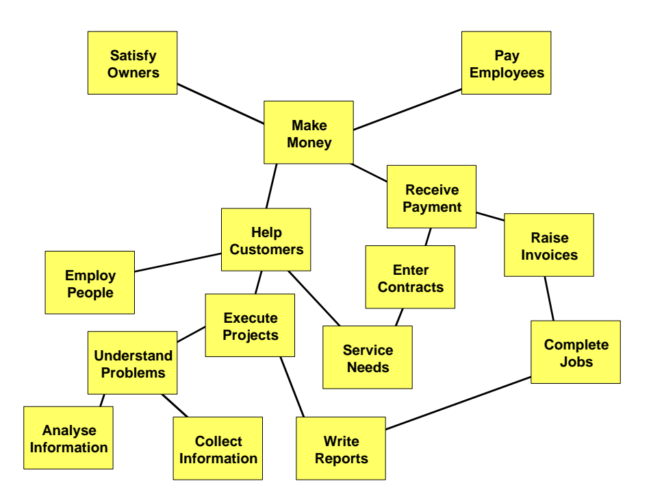
Figure 2: Example of FAST output

For an organisation in business with the objective of making money, the ultimate benefit is revenue. However, there may be intermediate benefits, such as customer satisfaction, image and reputation, market differentiation, technical excellence or simply being an enjoyable and desirable place to work. The value management approach is characterised by a value workshop. The value workshop aims to identify any activity that could be added or eliminated, with the potential to increase value. This is initiated by a functional analysis activity, known as FAST (Functional Analysis System Technique). FAST begins by asking what is the function of something (in this case the organisation), i.e. what does it do? It then repeatedly asks two questions: "How?" and "Why?". "Why?" cascades upward towards the root motivation while "How?" cascades downward towards basic activities. The result is a rather complex matrix of activities and motivations. A simple example of a FAST analysis is shown in Figure 2.